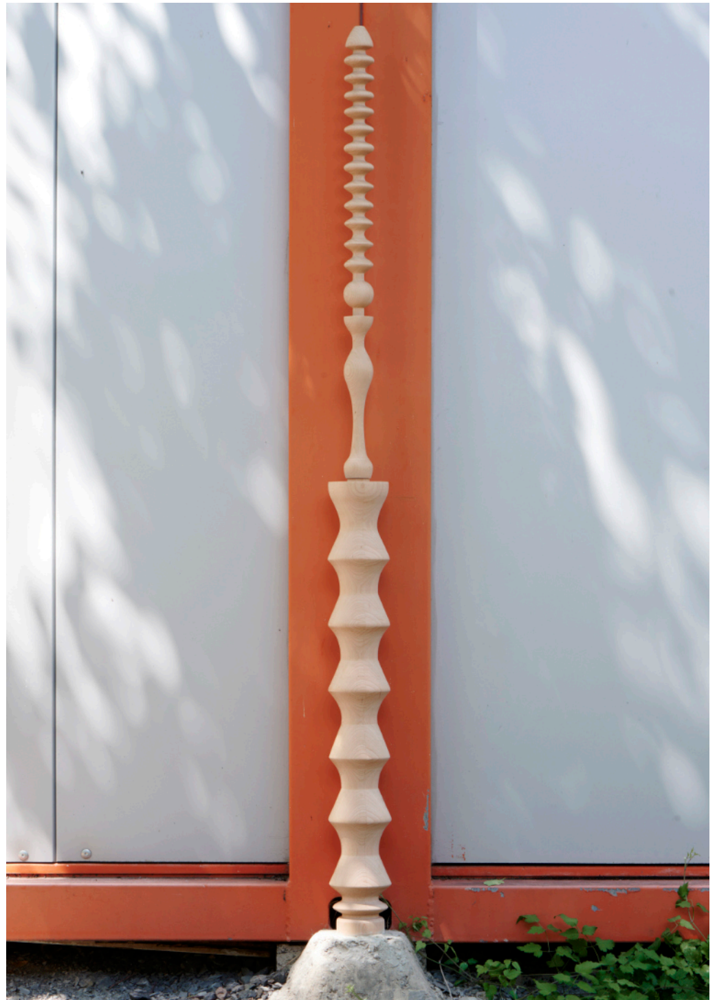
Lotus Marvel, 2022 Beech 178 x 12 cm