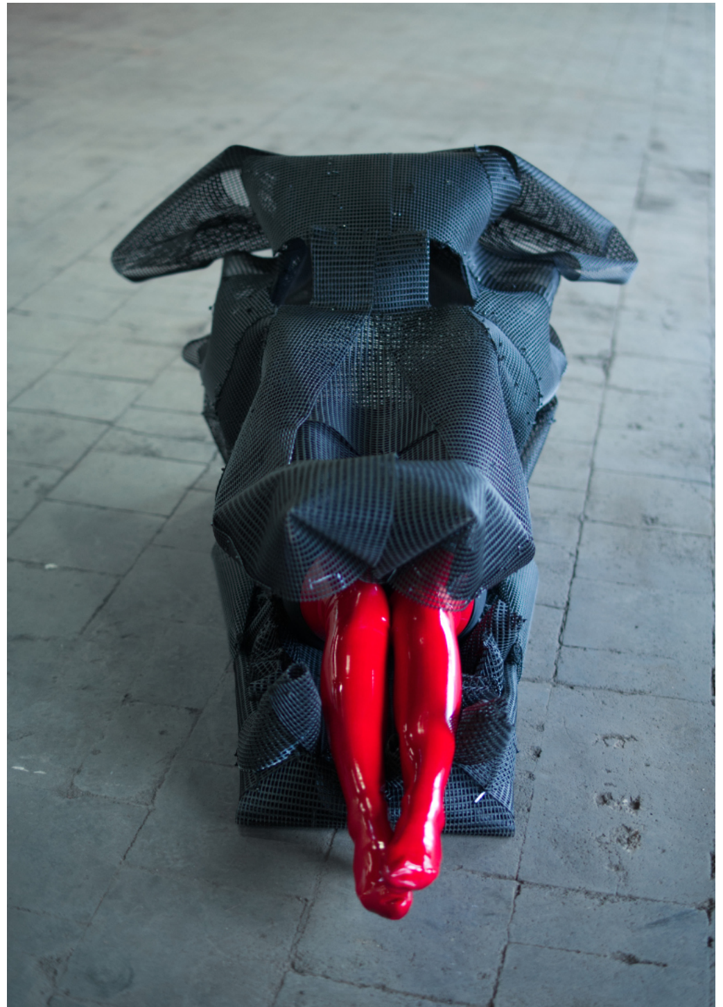
Pusat's Dream, 2021 Polynet, latex stockings, cable ties 200 x 100 x 75 cm (78.7 x 39.4 x 29.5 inch) Performance, long duration