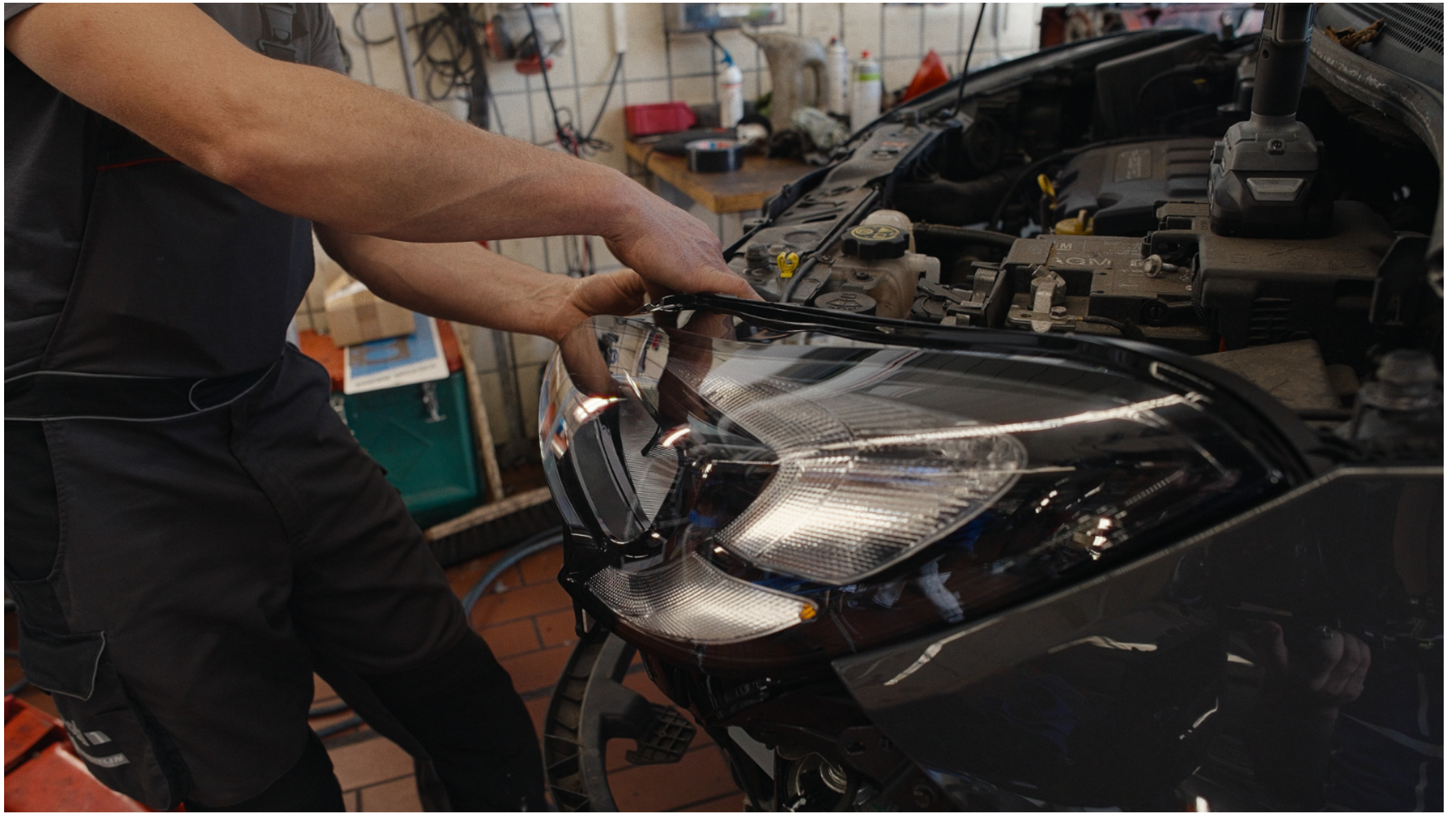
Care Without A Capital C (videostill)