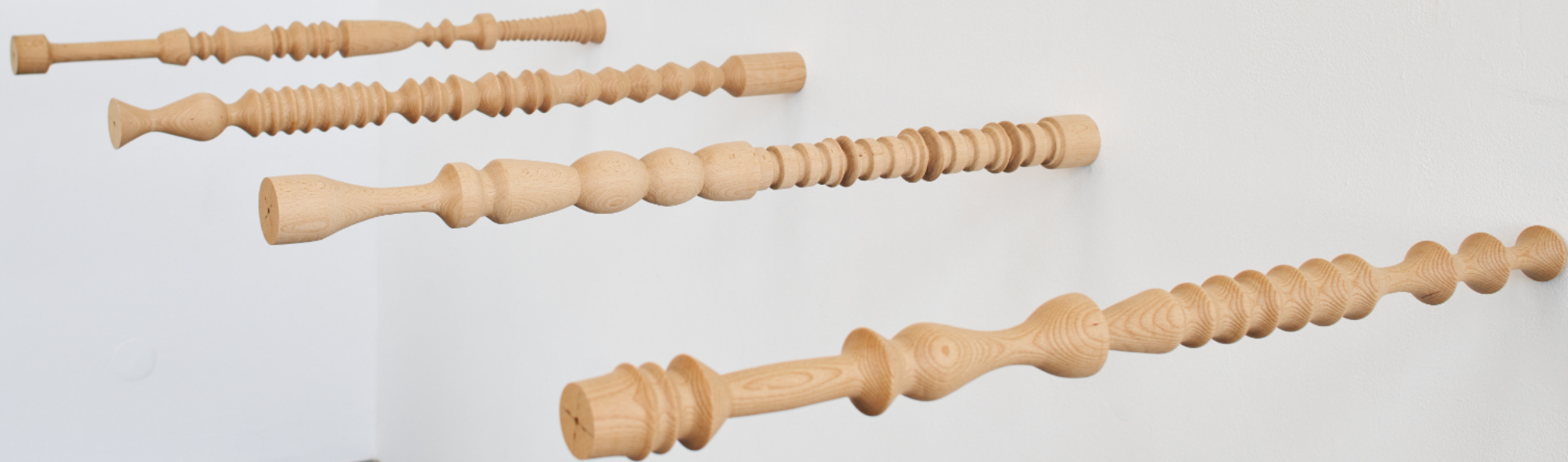
Installation view, 2023 Alte Waggonfabrik Mainz