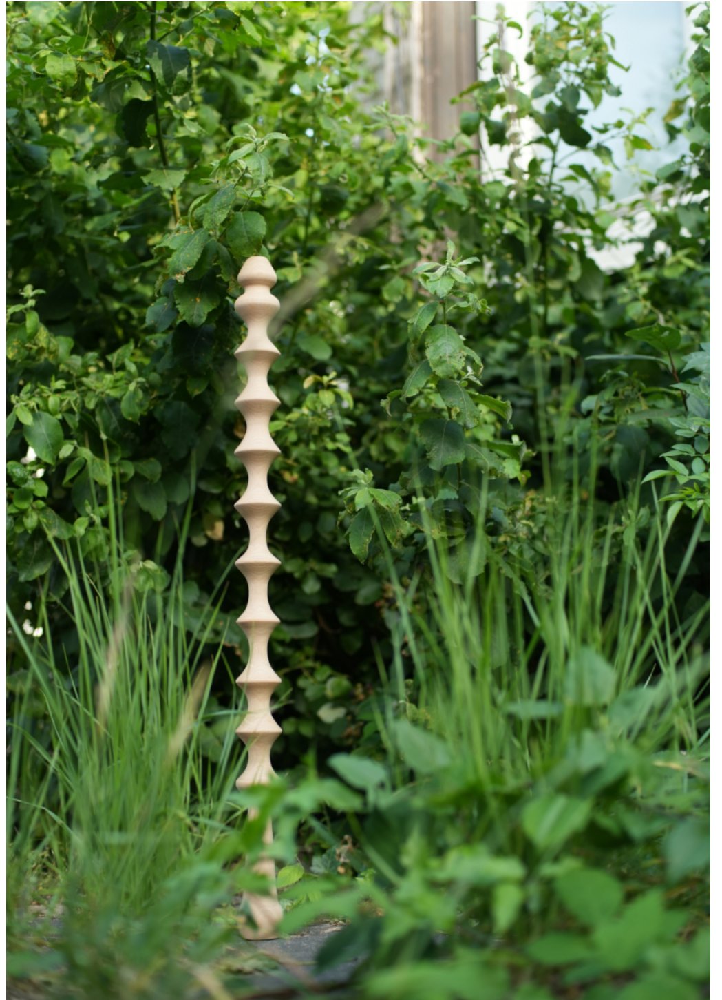
Love Humps, 2022 Beech 89 x 6 cm