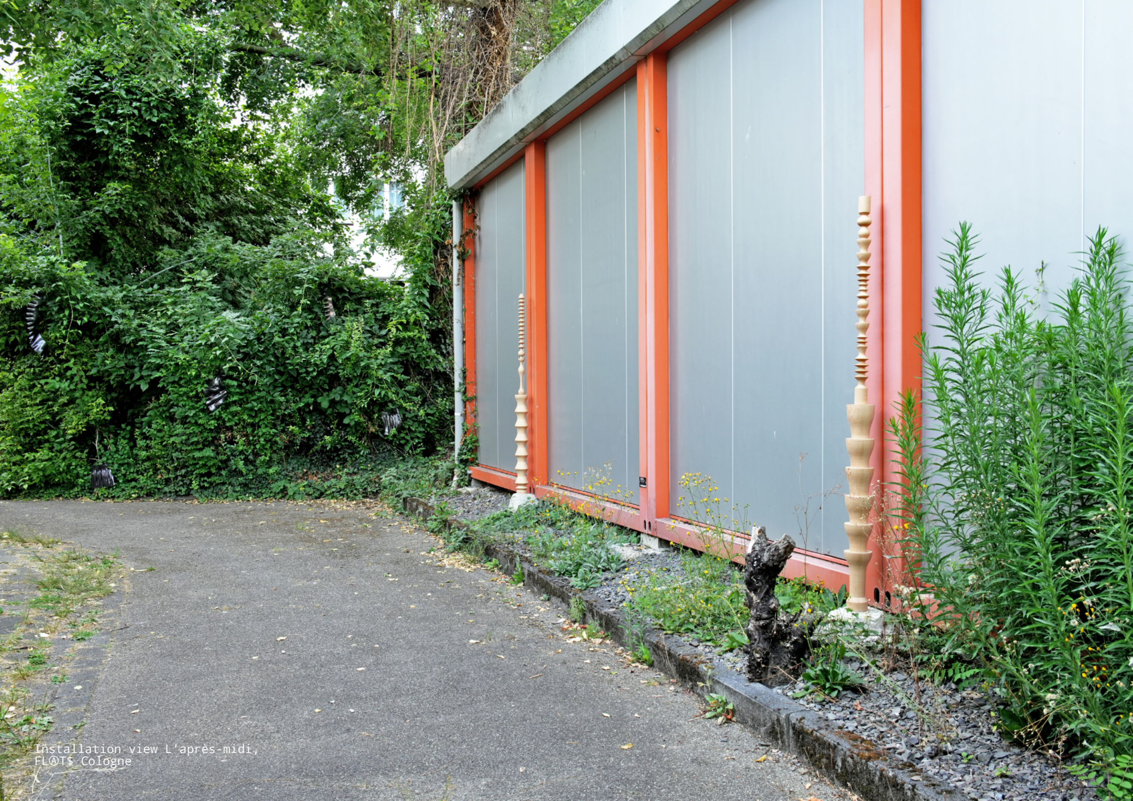
Installation view L'après-midi, FL@T$ CoLogne