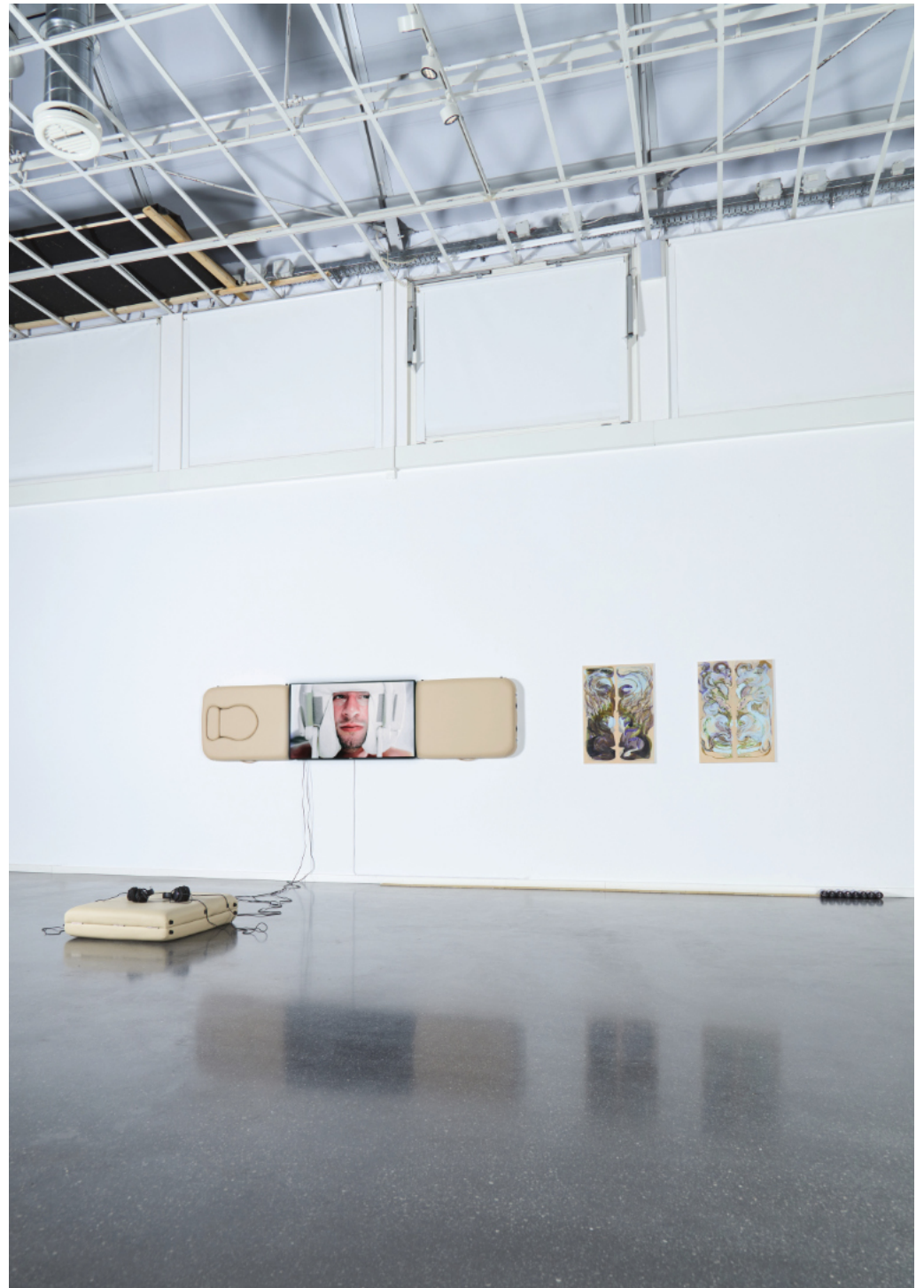
Installation view Alles Mögliche, Kunstverein Ludwigshafen