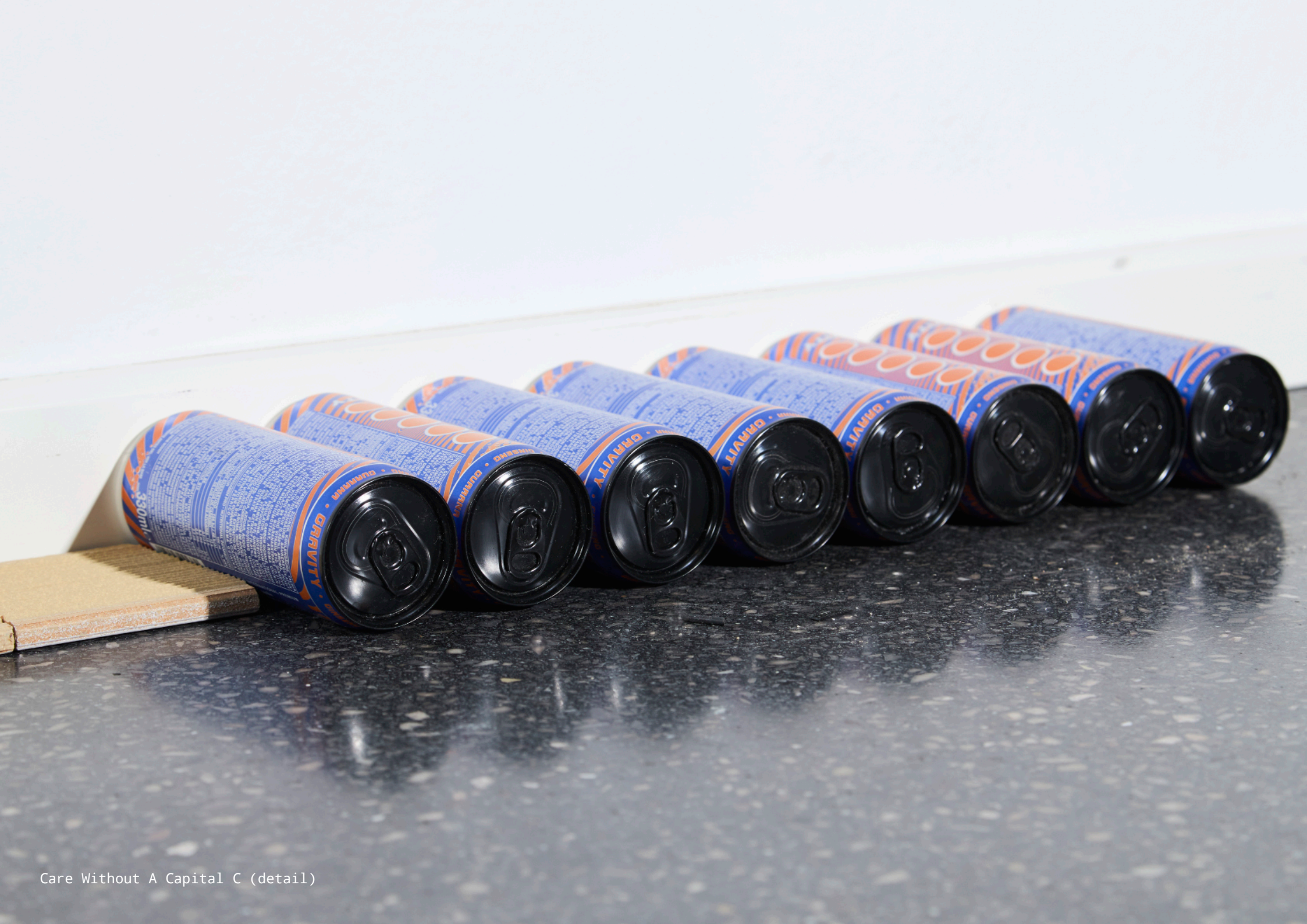
Care Without A Capital C (detail)