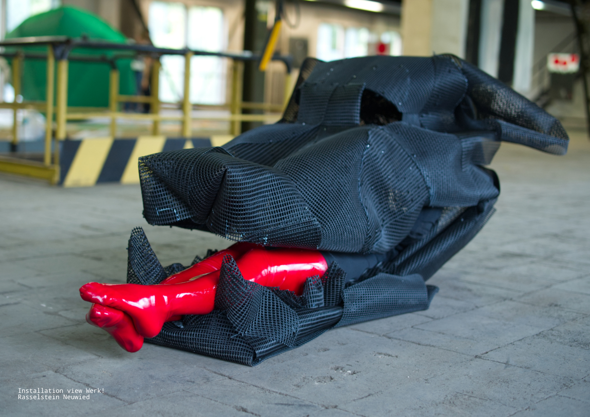
Installation view Werk! Rasselstein Neuwied