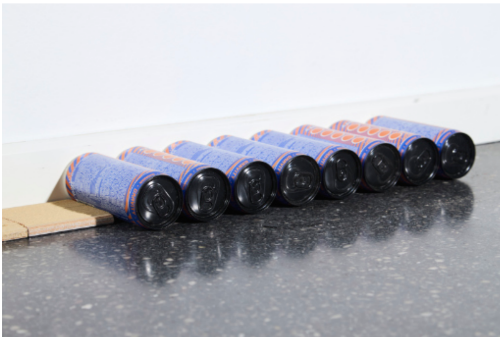
Care Without A Capital C, 2021. Videostill, 4K-video, sound, 9.28 min. https://vimeo.com/951237261