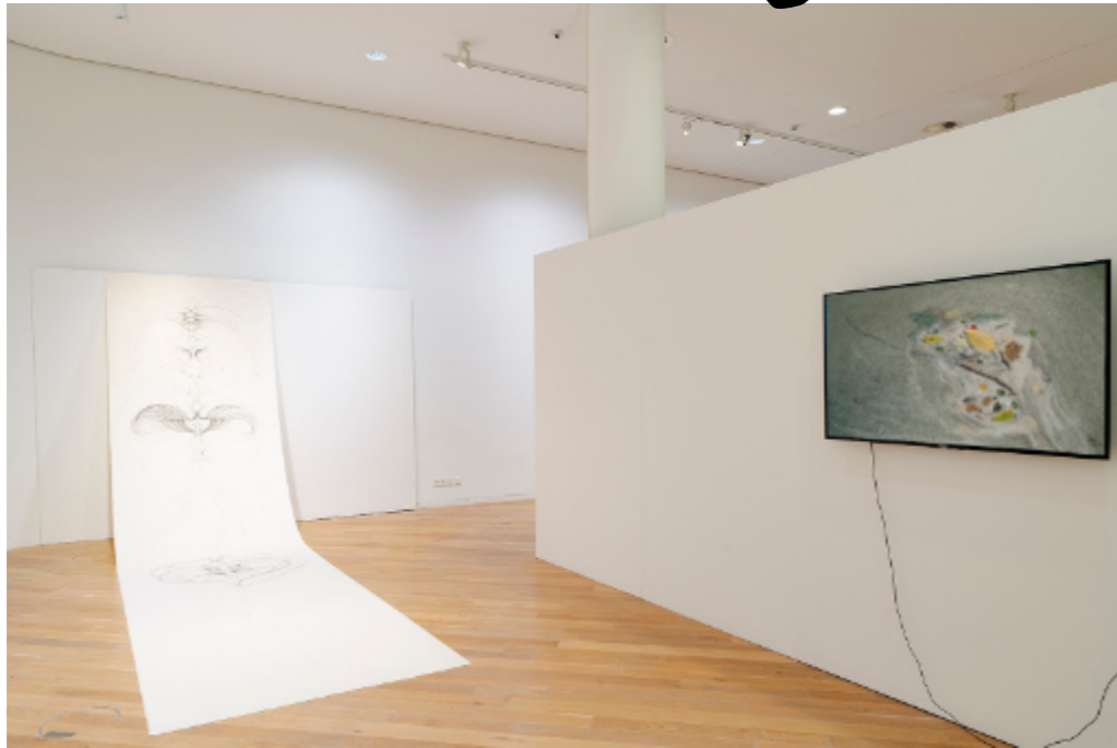
Installationview Coexist, Mittelrheinmuseum Koblenz