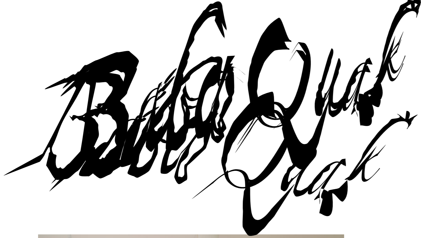
Baba Quak's Endless Drawings, 2024. Graphite on canvas, 680 x 150 cm (267.72 x 59.06 inches).