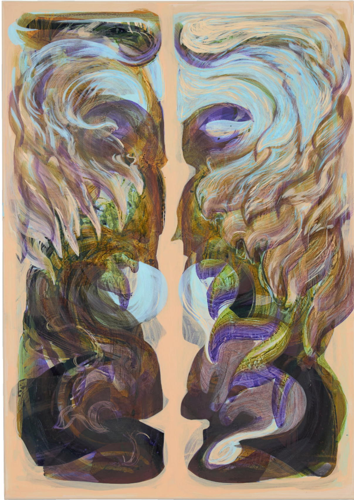
Dreifacher Erwärmer, 2021. Acrylic marker, acrylic, ink on canvas, 85 x 60 cm (33.46 x 23.62 inches).

Care Without A Capital C revolves around a massage in a professional car repair shop. The sound of the video emphasises the sometimes absurd tenderness that arises from the touching of bodies, both human and mechanical. Repair and regeneration as central themes in the work of the masseur and the mechanic offer a new perspective on health and labour in their intertwining. The action itself becomes a treatment focused on the seemingly outmoded bodies of the car and the male back.