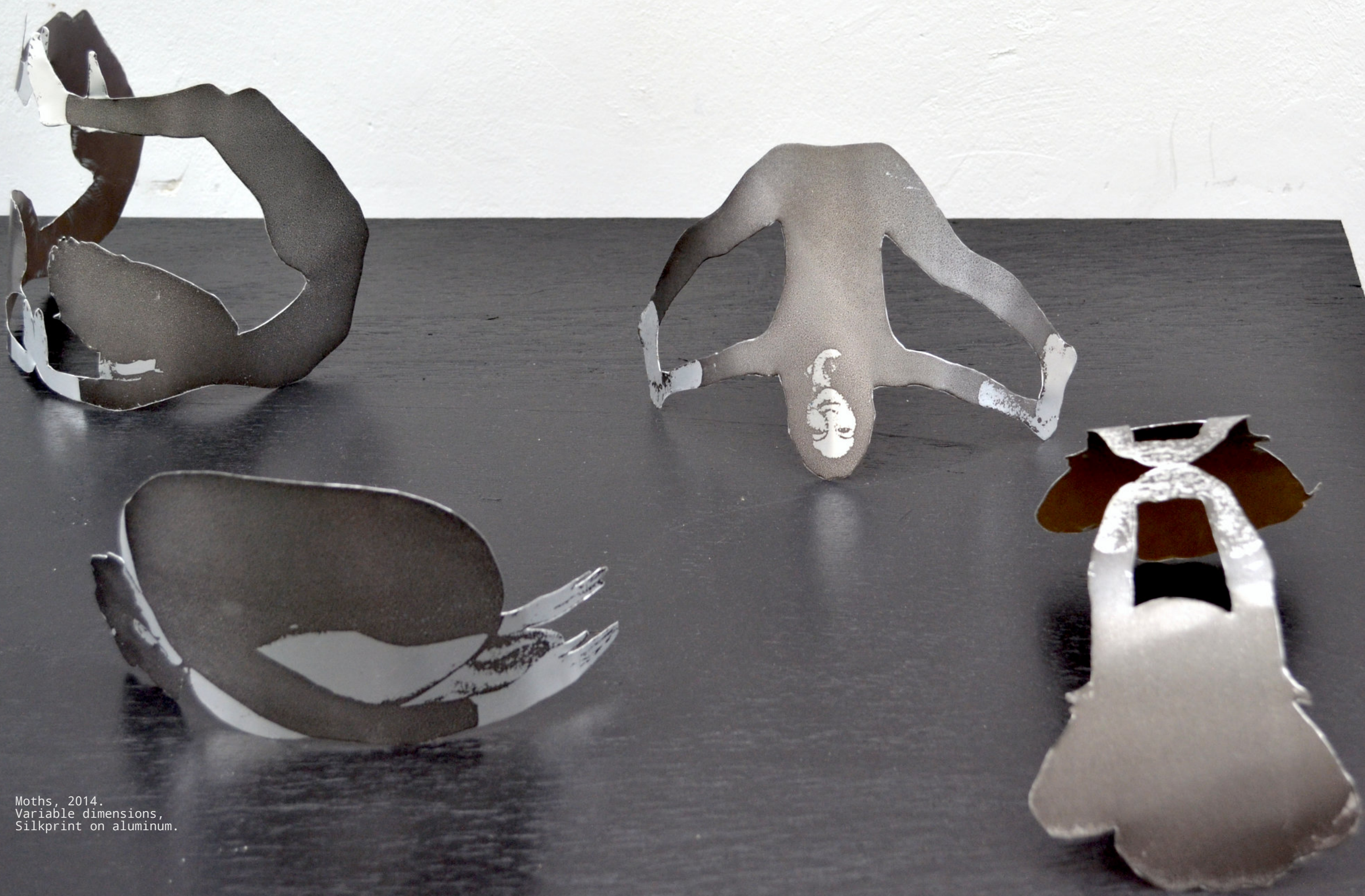
Moths, 2014. Variable dimensions, Silkprint on aluminum.