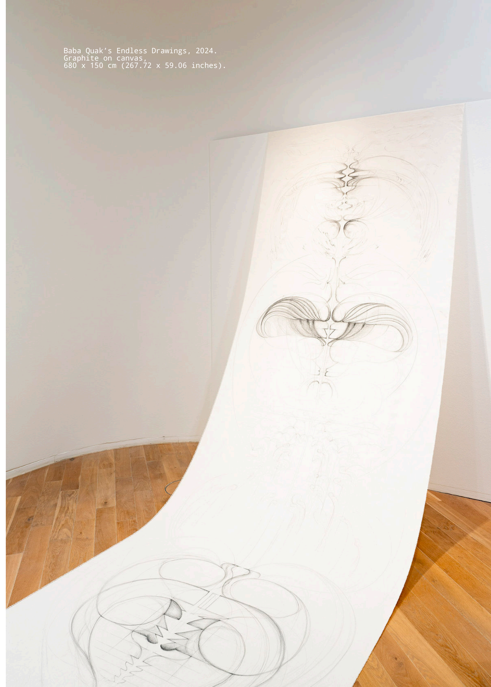
Baba Quak's Endless Drawings , 2024. Graphite on canvas, 680 x 150 cm (267.72 x 59.06 inches).

Installationview Coexist, Mittelrheinmuseum Koblenz