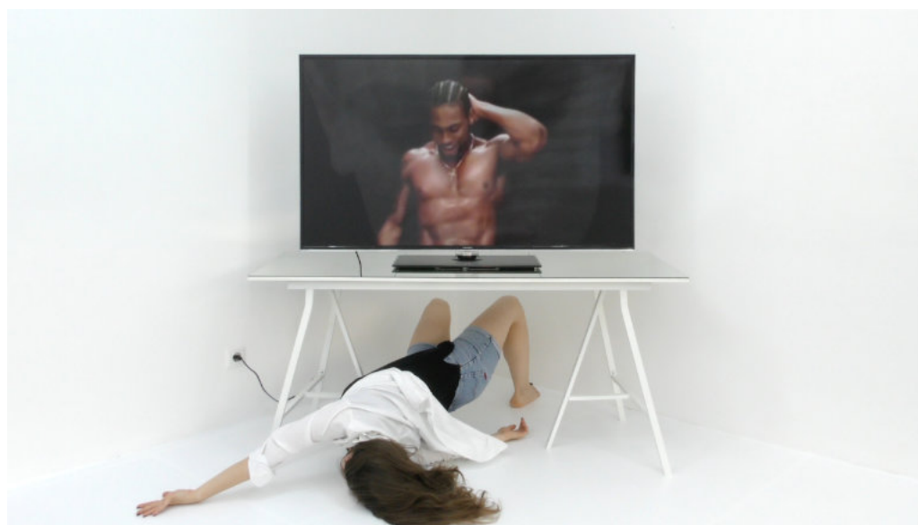
Natureboy, 2016. Detail and videostill, HD-video, sound, 6.17 min. https://vimeo.com/556845506

Natureboy begins with me lying under a video installation that shows D'Angelo and Sinéad O'Connor simultaneously singing two of my favourite love songs of all time: 'How does it feel' and 'Nothing compares 2 U'. Their muffled voices, superimposed gestures and facial expressions create a ghostly and eerie mix. Music videos were very important to me growing up and influenced my emotional state between dreaminess and consumption. Towards the end of the first video loop cycle, I go into the yoga pose 'Chakrasana', which is supposed to open the heart. In this position, I perform the song 'Natureboy' by Eden Abas. The lyrics tell the story of a boy who goes out into the world in search of the meaning of life, only to discover that loving and being loved is the ultimate answer.