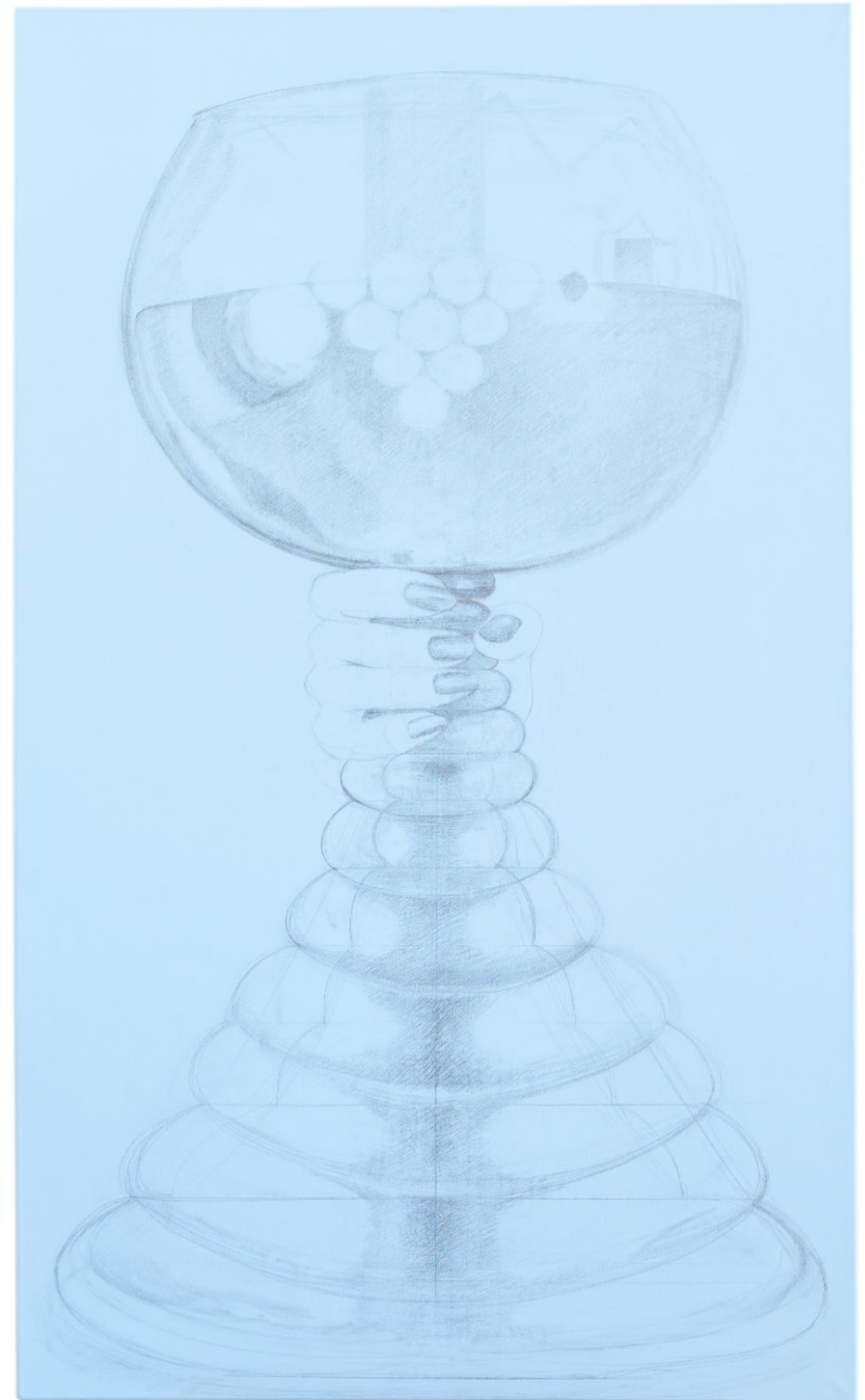
Weinkönigin, 2024 Graphite, acrylic on canvas 200 x 120 cm (78,4 x 47,2 inches)