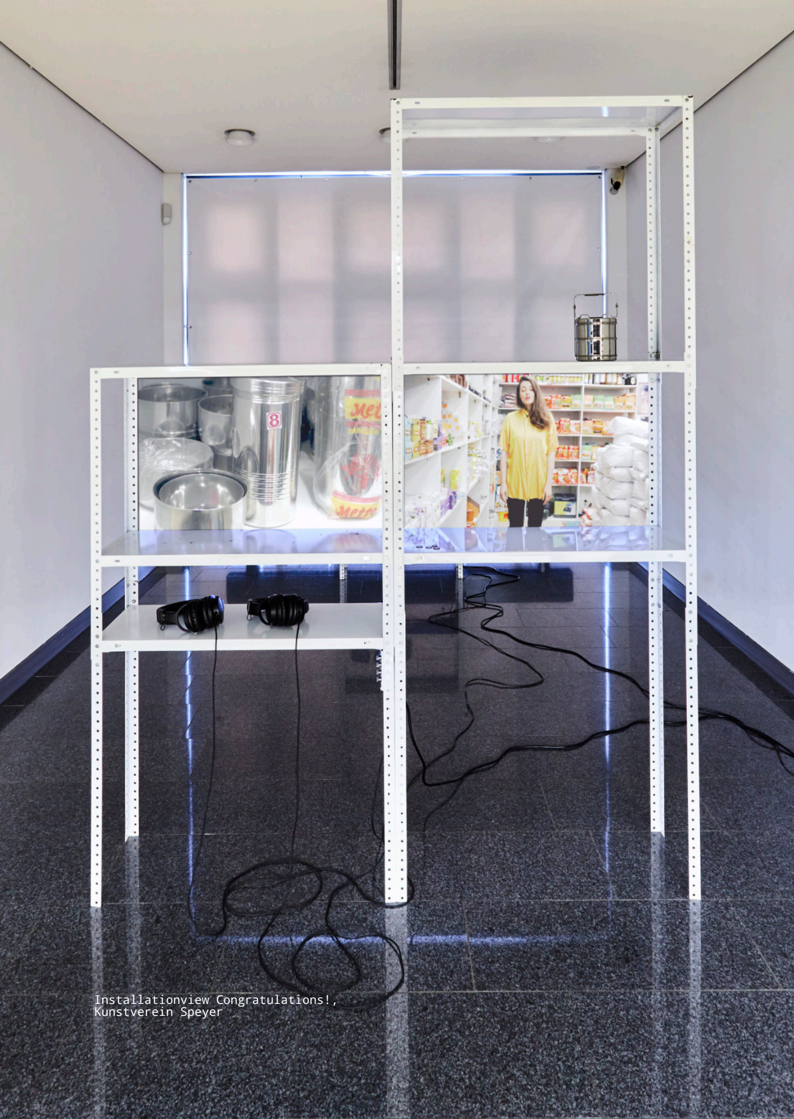
Installationview Congratulations!, Kunstverein Speyer