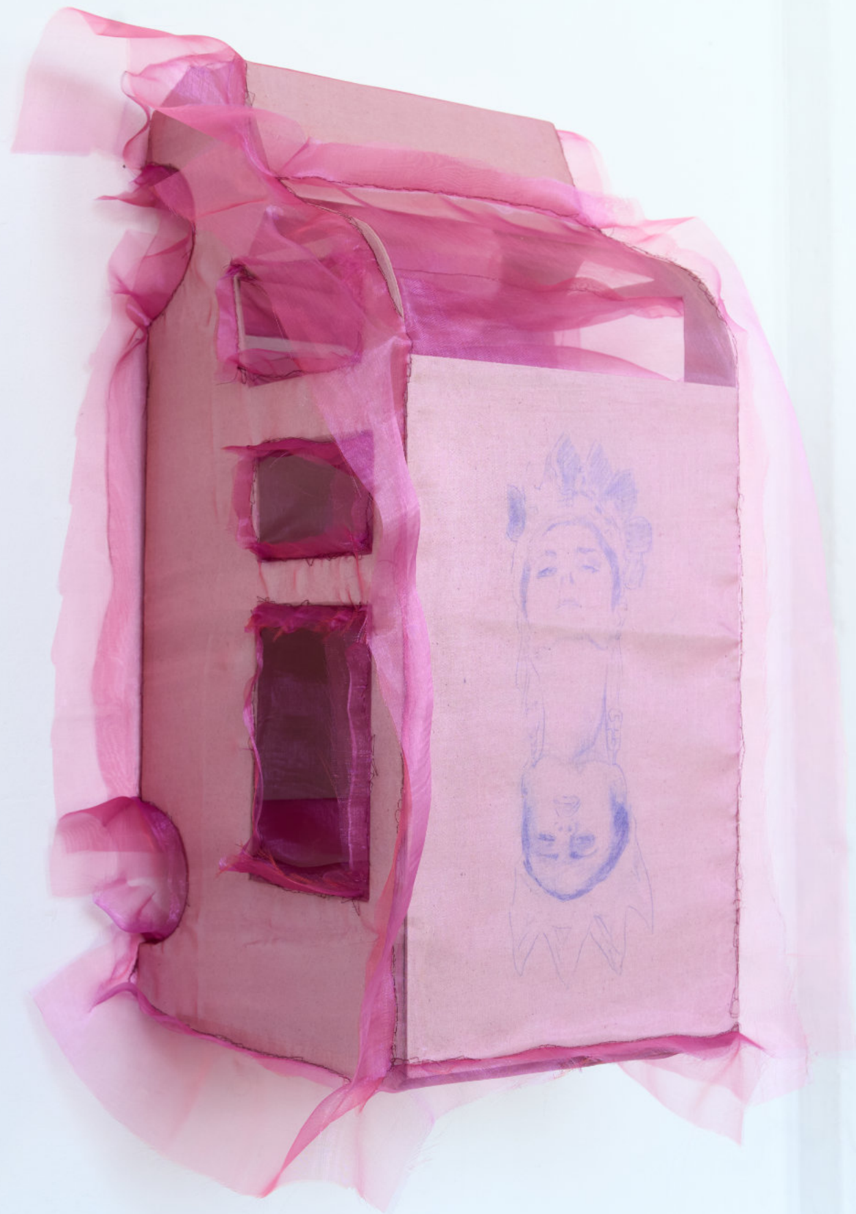
RV, 2024 Bluepaper on cardboard, gauze, thread, tape 28 x 60 x 25,5 cm (11 x 23,6 x 10 inches)