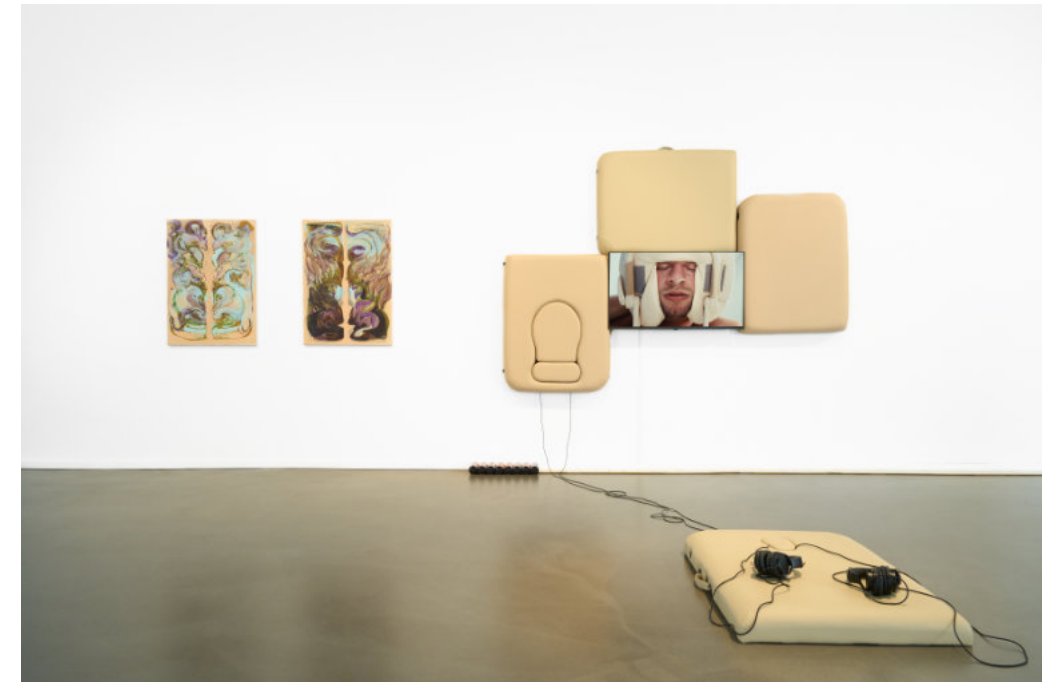
Installation view Transformationen, Museum Pfalzgalerie Kaiserslautern