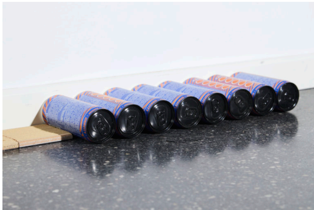
Care Without A Capital C, 2021. Videostill, 4K-video, sound, 9.28 min. https://vimeo.com/951237261 Care Without A Capital C (Detail)

Installationview Transformationen, Museum Pfalzgalerie Kaiserslautern